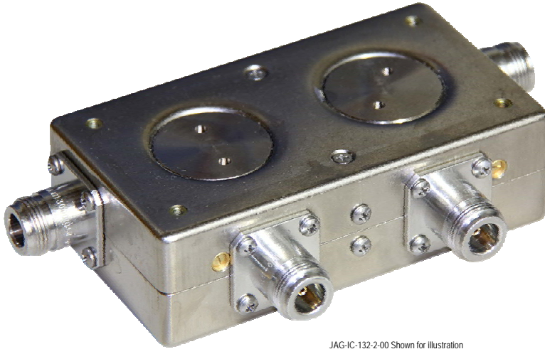
JAG-IC-132-2-00 Shown for illustration