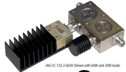
JAG-IC-132-2-6030 Shown with 60W and 30W loads